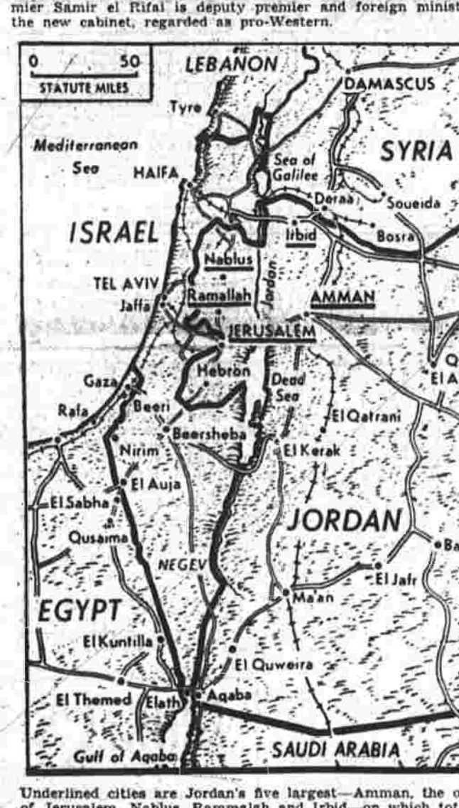
Underlined dots are Jordan's five largest—Amman, the old city of Jerusalem, Nablus, Ramallah and Irbid—on which total curfew was imposed. The entire country had martial law as a new treaty was formed with King Hussein trying to end yet another crisis.