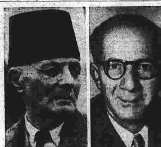
Abraham Hassen (left) is new Jordan premier, and former Premier Shariq is deputy premier and foreign minister in the new cabinet, regarded as pro-Western.